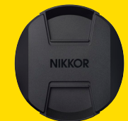
FRONT LENS CAP LC-K104