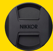
FRONT LENS CAP LC-Z1424