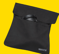
LENS CASE CL-C2