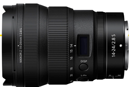
NIKKOR Z 14-24 mm f / 2.8 S